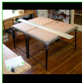
Two 1080 MFT's joined together side by side to form a large work surface